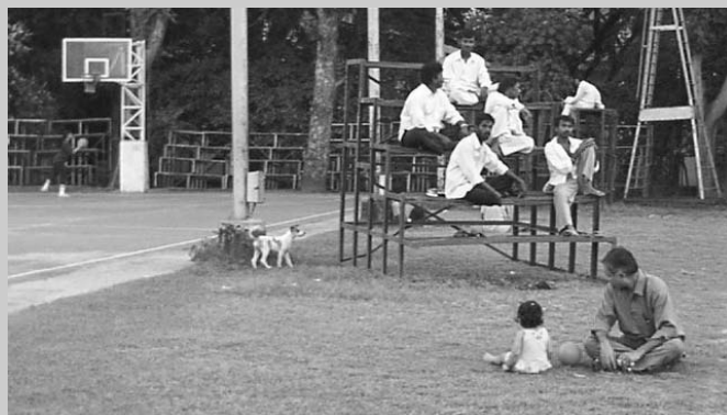
Institute Gymkhana Ground: Practice Field or A Park? With ladies taking evening walks on the tracks while sprinters whiz by and with kids around as matches go on, its an accident waiting to happen. And never mind the prominent notice board which clearly says "small children are not allowed during practice hours" le between 5:00 p.m.- 8:00 p.m.

It was observed that the cricket pitch was used for the KV school tournament, but when the IIT cricket team wanted the pitch, they were